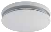
ComfoValve Luna S125