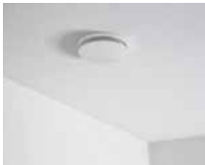
ComfoValve Luna S125, ceiling installation