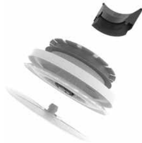
ComfoValve Luna S125, exploded-view drawing