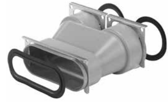
Junction 2x75 to Flat 51