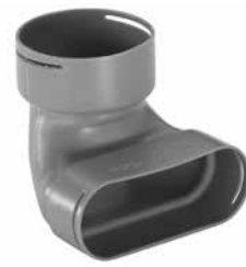
Bend junction 90 to Flat 51

Zehnder ComfoTube meets all the requirements for quick and easy installation. The stable tube (ring stiffness as per DIN EN ISO 9969) is easy to handle, very lightweight and extremely corrosion-resistant. The 100% pure material features a smooth inner surface and optimum tightness, and is also easy to clean. The excellent, tried-and-tested product quality is also indicated by the SKZ seal.