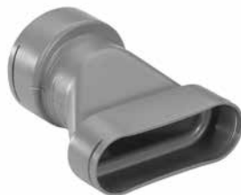
Junction 90/75 to Flat 51